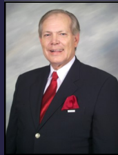
Mayor Marshall Kamena